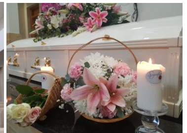
White cremation Albatross

The silk flowers provided are the same as displayed in the images of the coffins